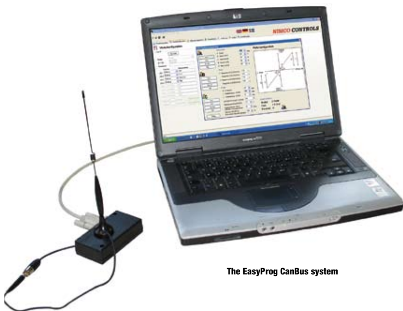
The EasyProg CanBus system

The CV 2000 LS is a post-compensated load-sensing valve with a flow rate of 125 l/min per port