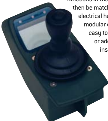
The EPC600 is a programmable CANbus joystick with integrated display

The CV 2000 LS valve and EasyProg software allows the machine builder and its service personnel maximum flexibility in designing optimal machine load control and servicing the hydraulic systems of its machines. It allows for maximising energy-saving functions with no detriment to machine performance and productivity and can be used in both open-centre and load-sensing circuits. ivt ⚡ Torbjörn Nord is founder and CEO of the Nimco Controls Group