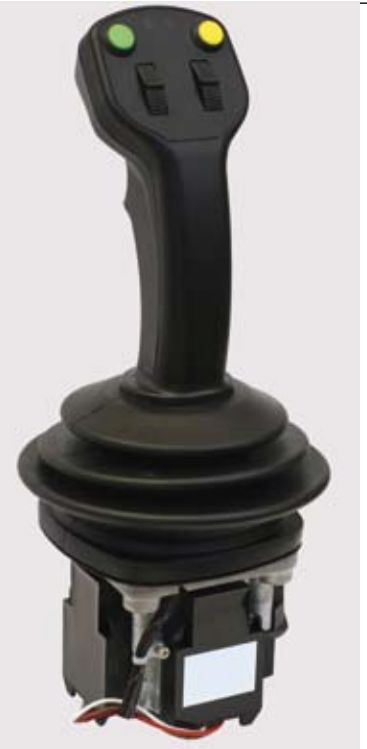
The EPC700 is a heavy-duty joystick

It is also possible for the service engineer to see the general status of the machine, read the usage pattern and